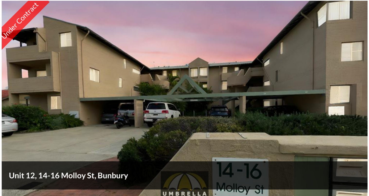
Unit 12, 14-16 Molloy St, Bunbury