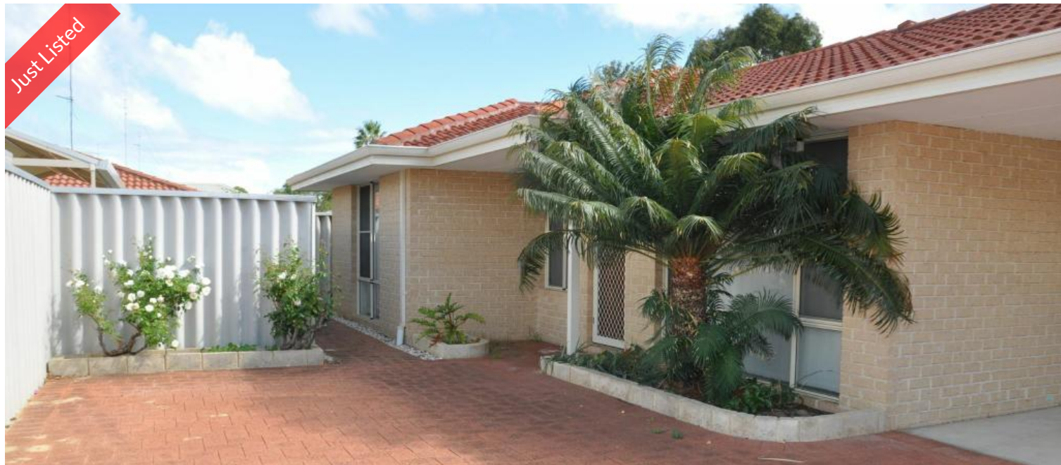
Unit 2, 36 Wisbey St, Carey Park