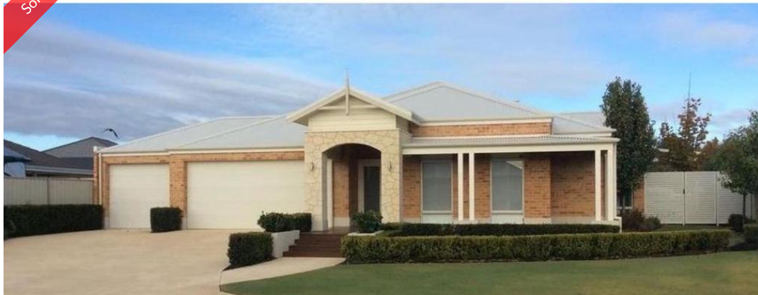
6 Orion Lane, Australind