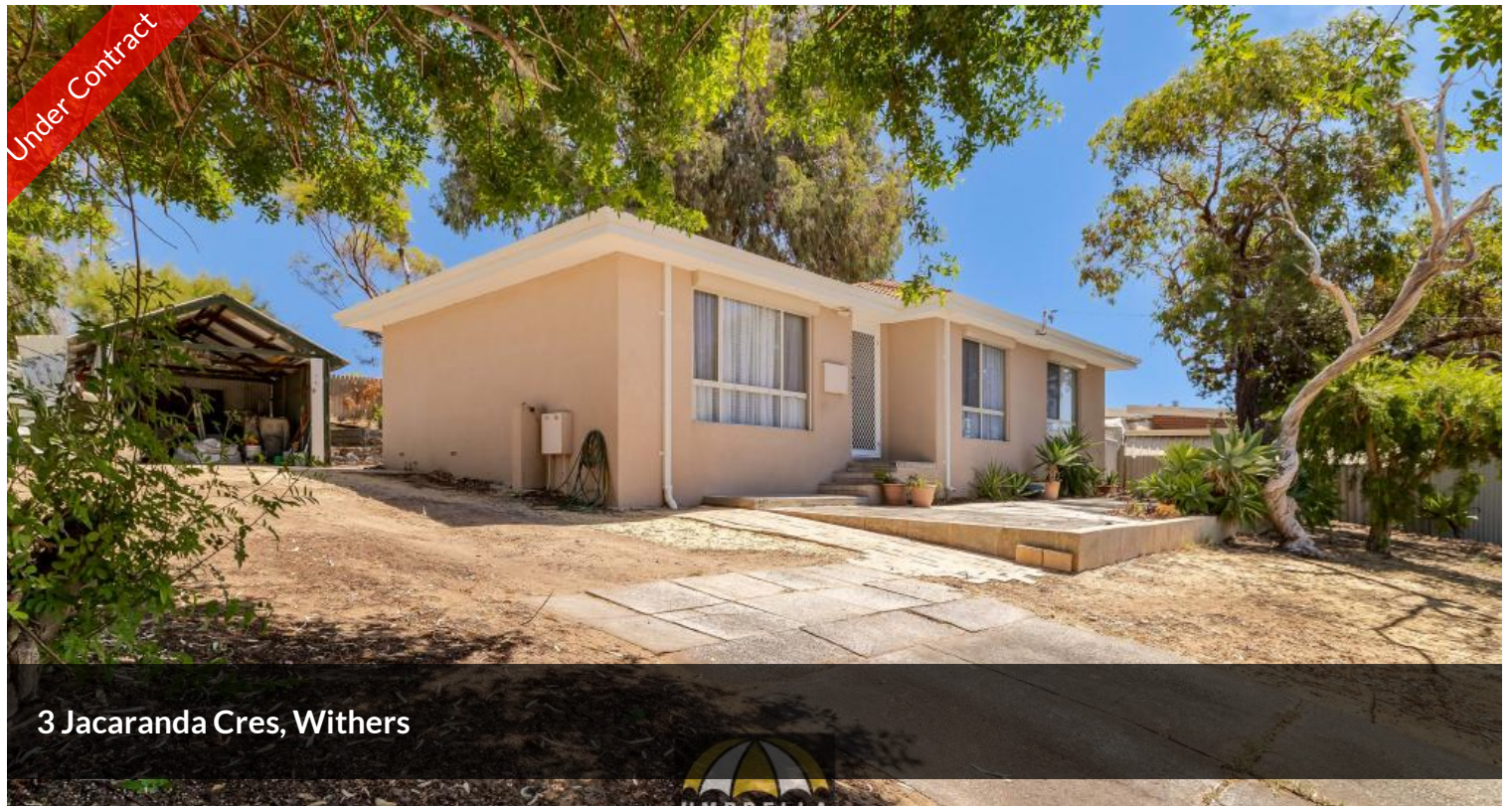
3 Jacaranda Cres, Withers