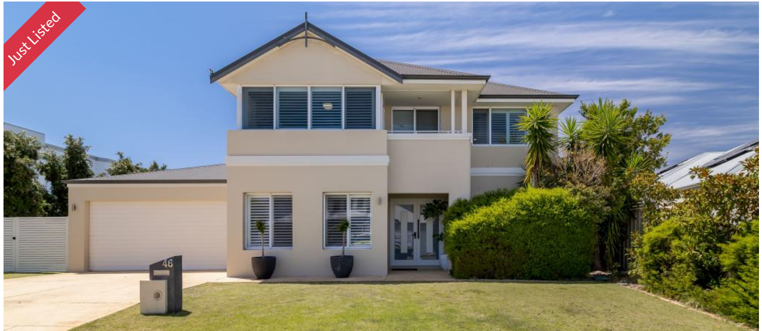
46 Portofino Crescent, Pelican Point