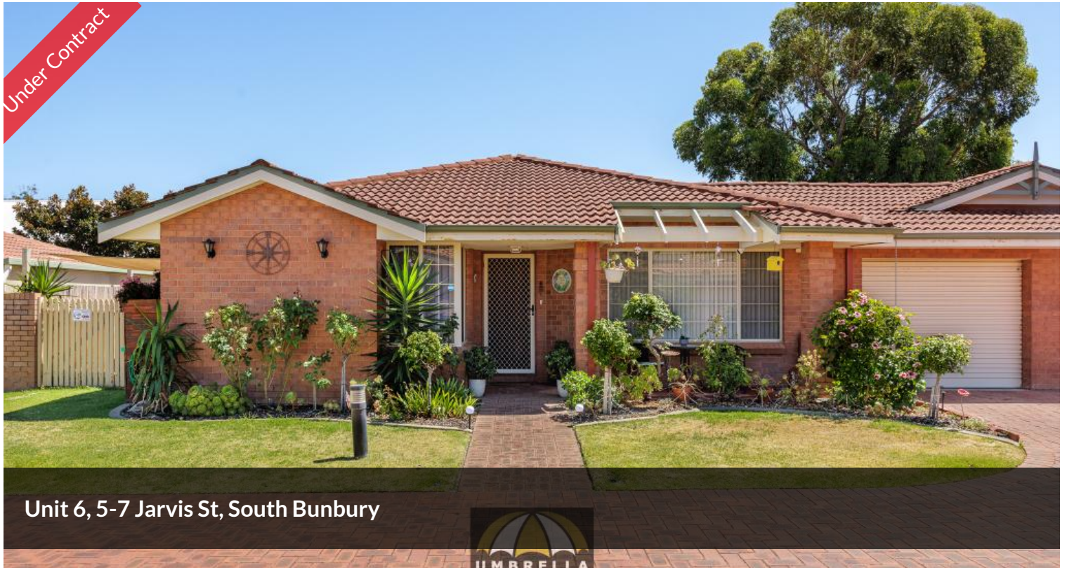
Unit 6, 5-7 Jarvis St, South Bunbury