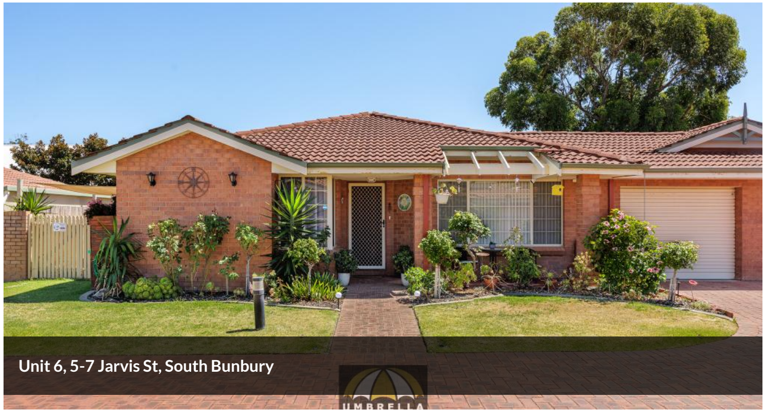
Unit 6, 5-7 Jarvis St, South Bunbury