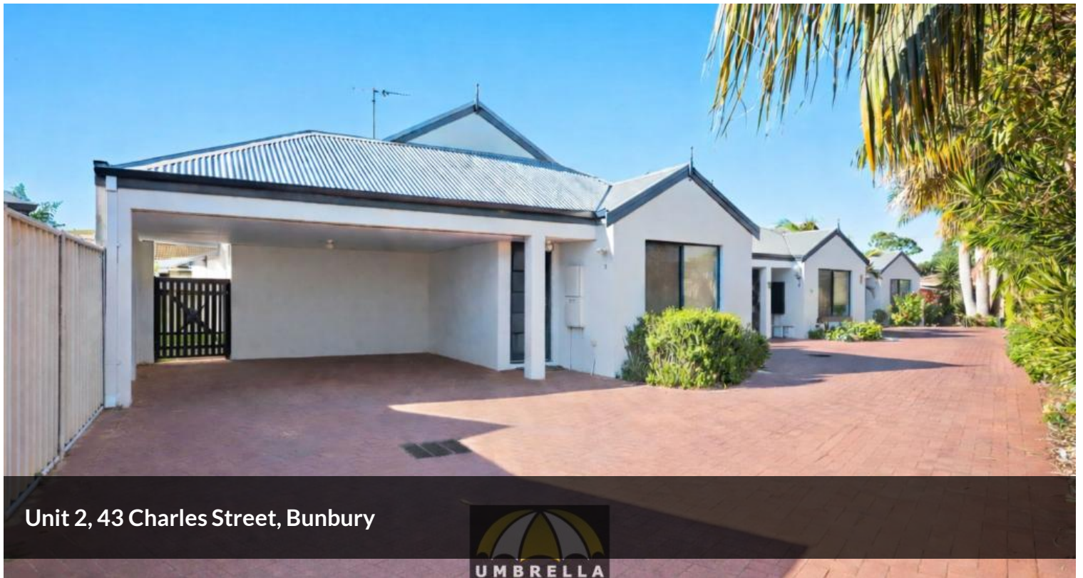
Unit 2, 43 Charles Street, Bunbury