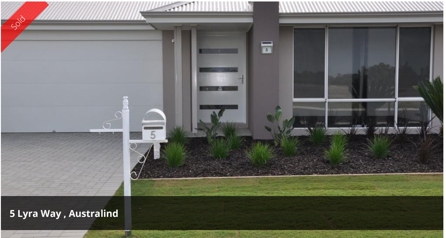
5 Lyra Way , Australind