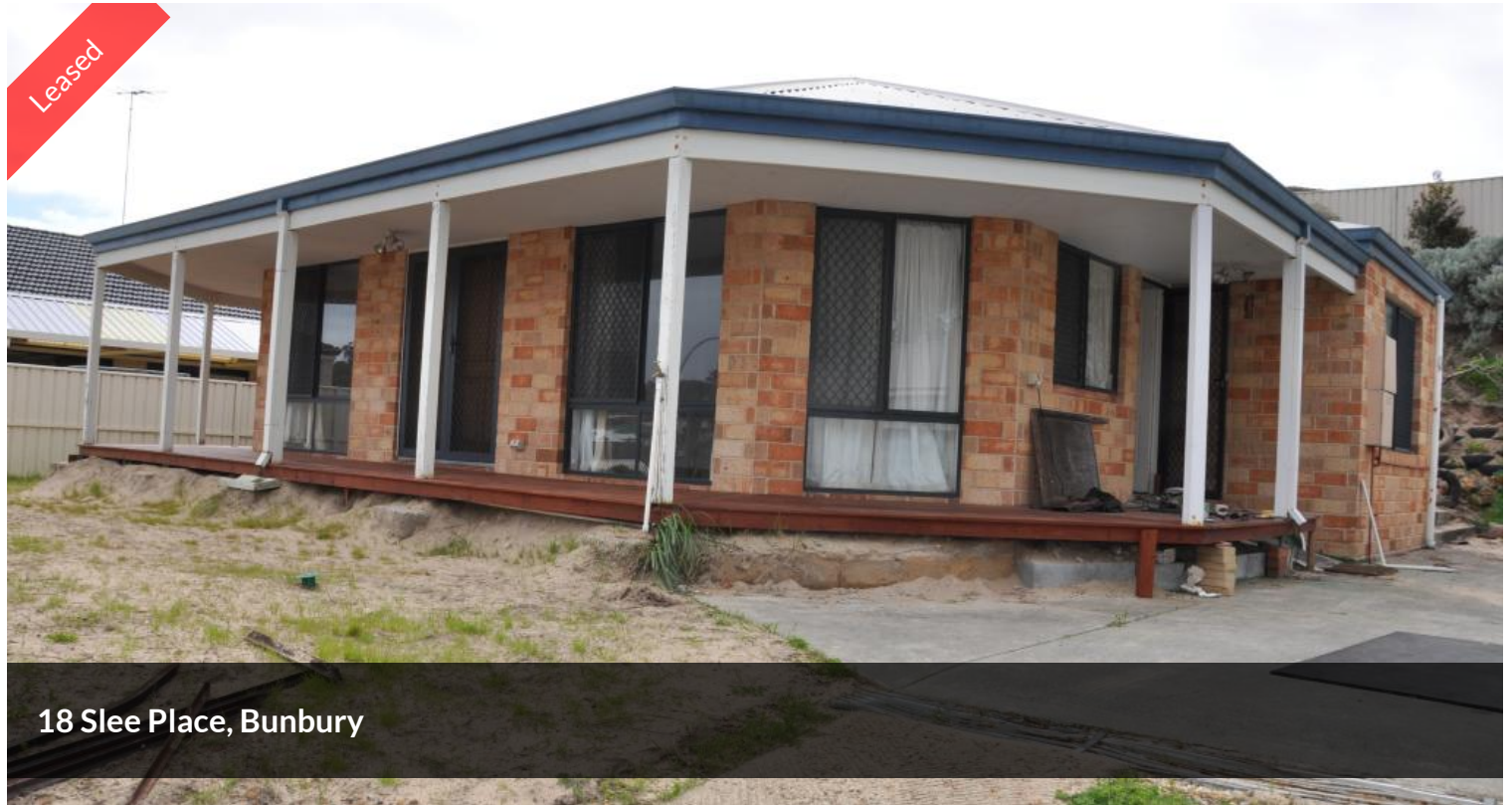
18 Slee Place, Bunbury