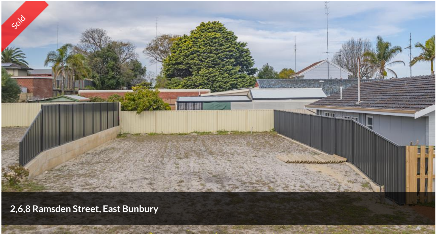
2,6,8 Ramsden Street, East Bunbury