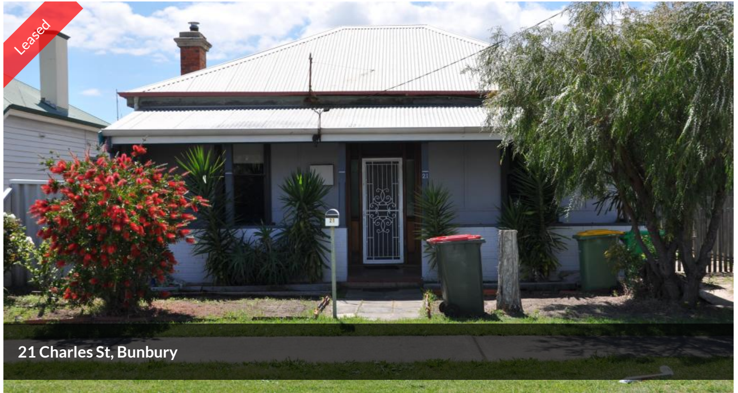
21 Charles St, Bunbury