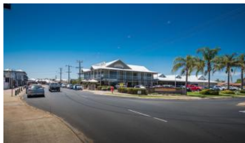
Unit 4, 1 King Rd, East Bunbury