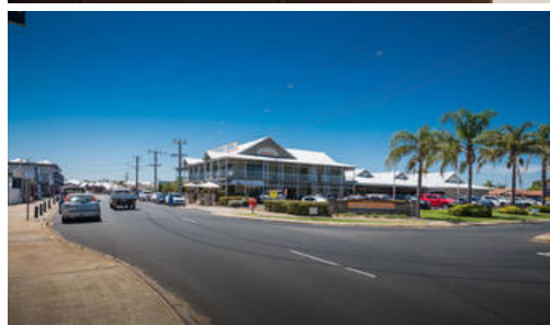
Unit 4, 1 King Rd, East Bunbury