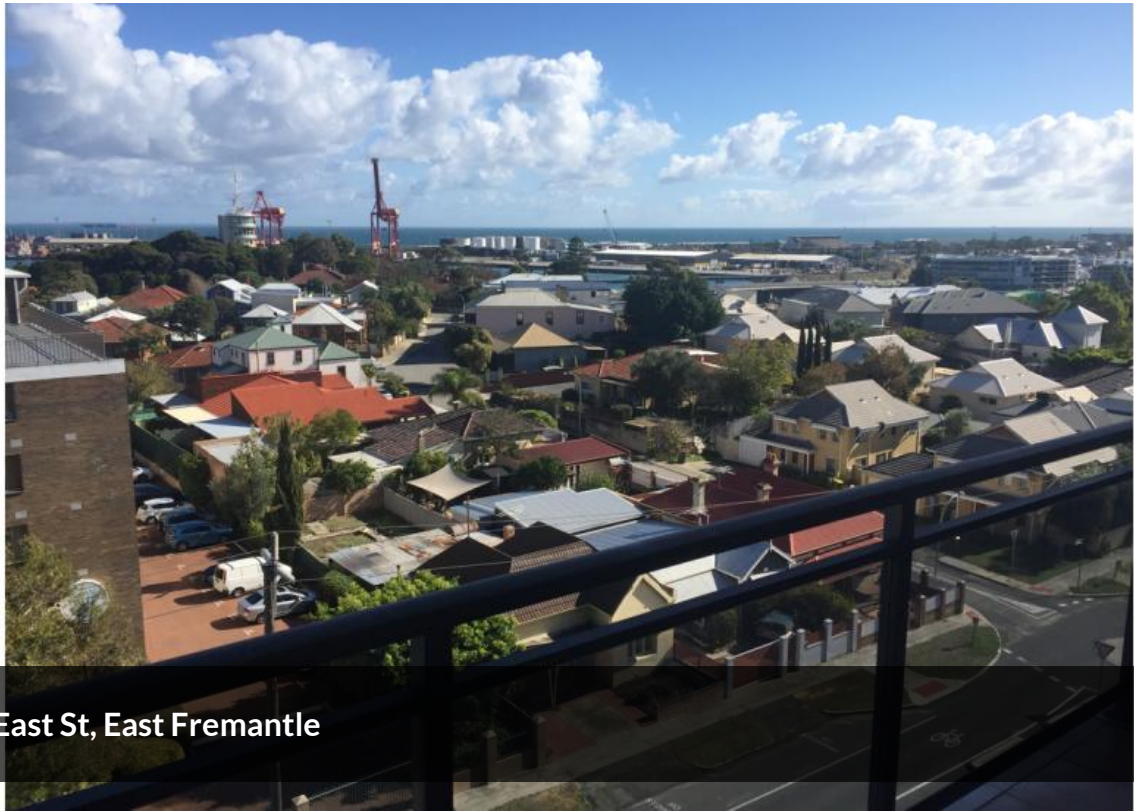
Unit 61, 46 East St, East Fremantle