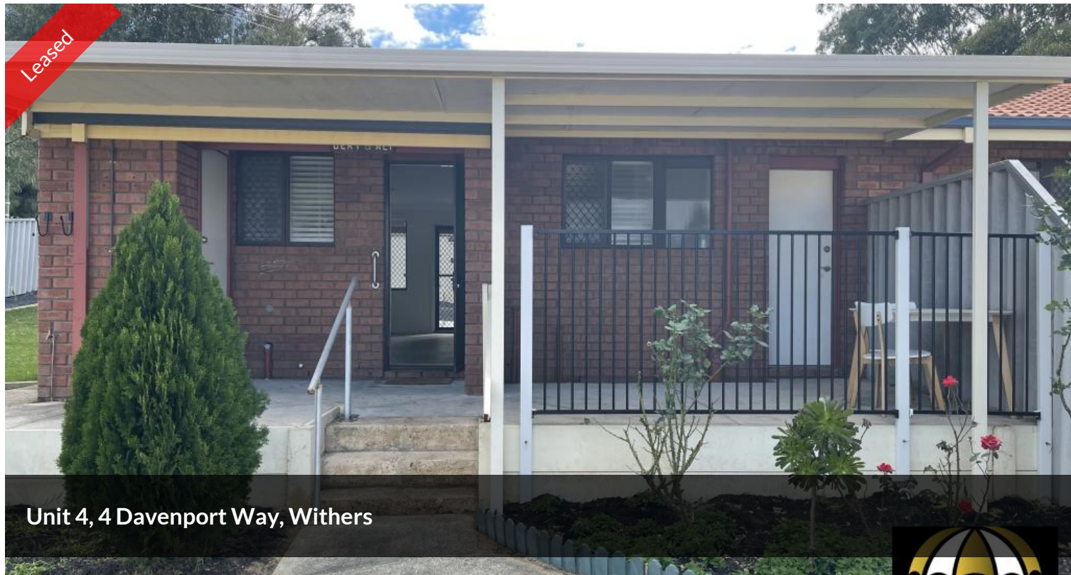
Unit 4, 4 Davenport Way, Withers