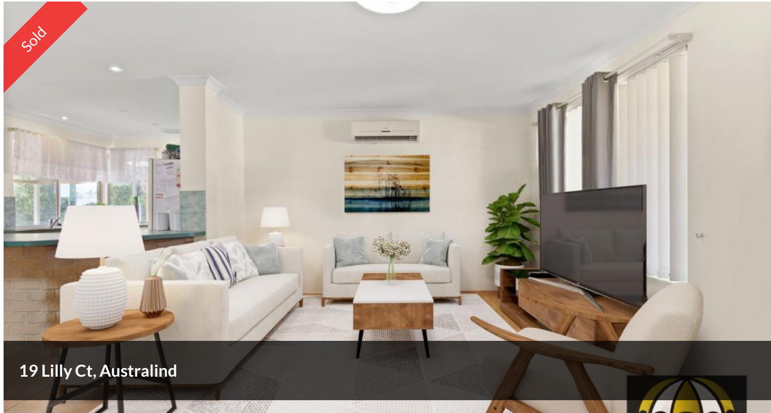
19 Lilly Ct, Australind