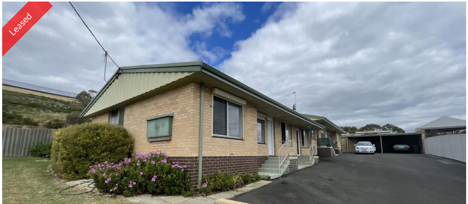
Unit 1, 9 Sherry St, Bunbury