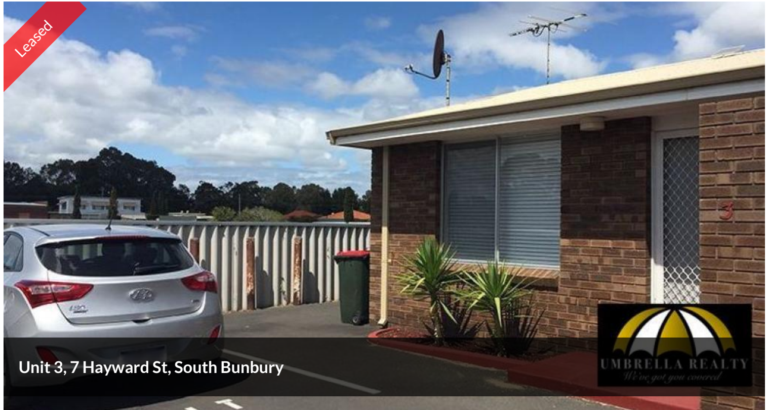
Unit 3, 7 Hayward St, South Bunbury