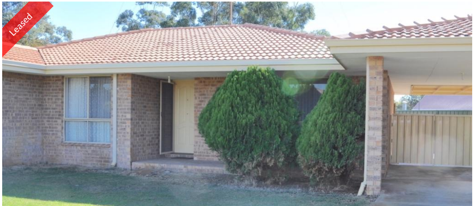
2, 8 Bythorne Place, East Bunbury