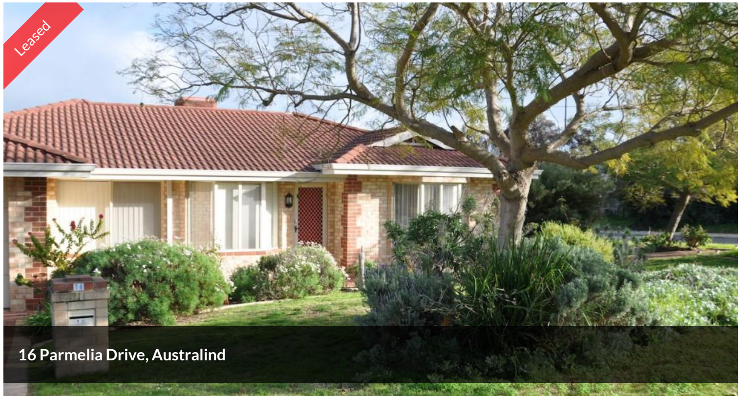
16 Parmelia Drive, Australind